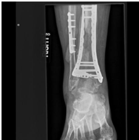
April 5, 2017 Post Op: Lat Ankle; Initiate EXOGEN Use