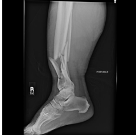
January 28, 2017 At Injury Lat Ankle