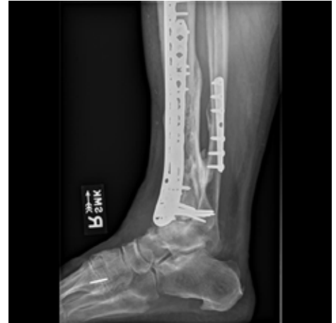
January 24, 2018: Lat Ankle; ~ 9 Months EXOGEN Use

The EXOGEN Ultrasound Bone Healing System is indicated for the non-invasive treatment of established nonunions* excluding skull and vertebra. In addition, EXOGEN is indicated for accelerating the time to a healed fracture for fresh, closed, posteriorly displaced distal radius fractures and fresh, closed or Grade I open tibial diaphysis fractures in skeletally mature individuals when these fractures are orthopaedically managed by closed reduction and cast immobilization. There are no known contraindications for the EXOGEN device.