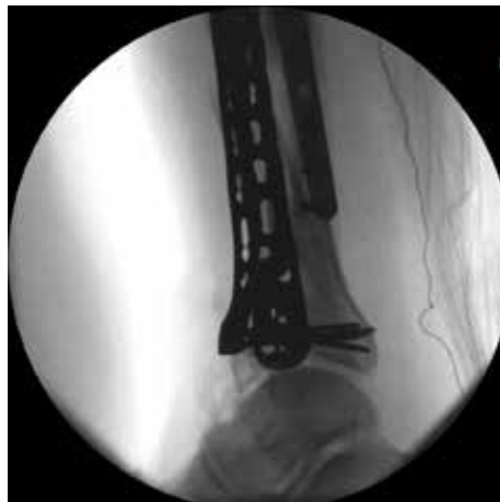
February 13, 2017 Fluoro: ORIF Intraop Lat1