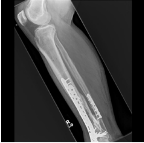
July 19, 2017: Lat Tibia; ~ 3 Months EXOGEN Use