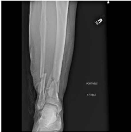
January 28, 2017 At Injury AP Ankle