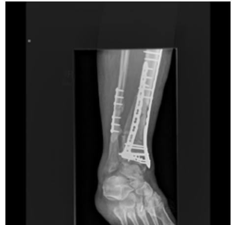
April 5, 2017 Post Op: AP Ankle; Initiate EXOGEN Use