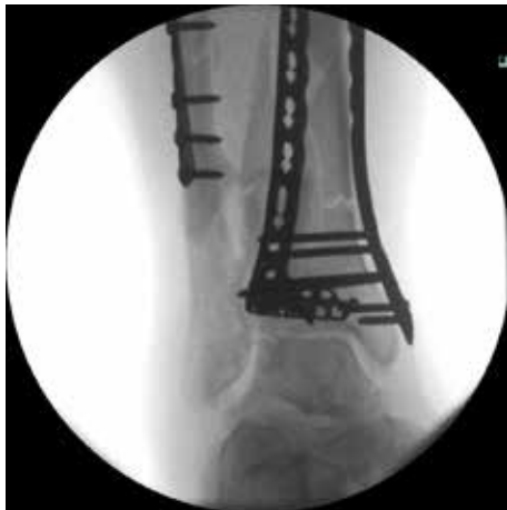
February 13, 2017 Fluoro: ORIF Intraop AP1