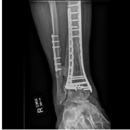
January 24, 2018: AP Ankle; ~ 9 Months EXOGEN Use