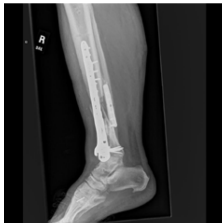
April 5, 2017 Post Op: Lat Tibia; Initiate EXOGEN Use