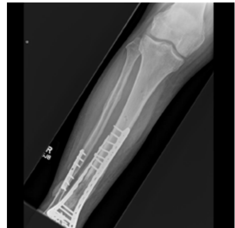
July 19, 2017: AP Tibia; ~ 3 Months EXOGEN Use